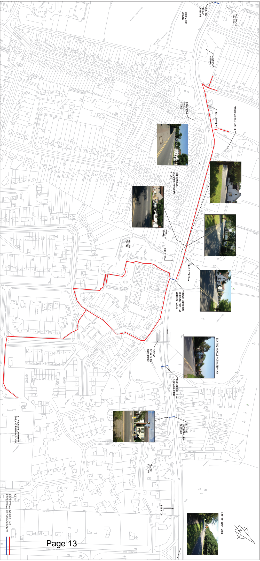
GENERAL ARRANGEMENT SCALE 1:1250